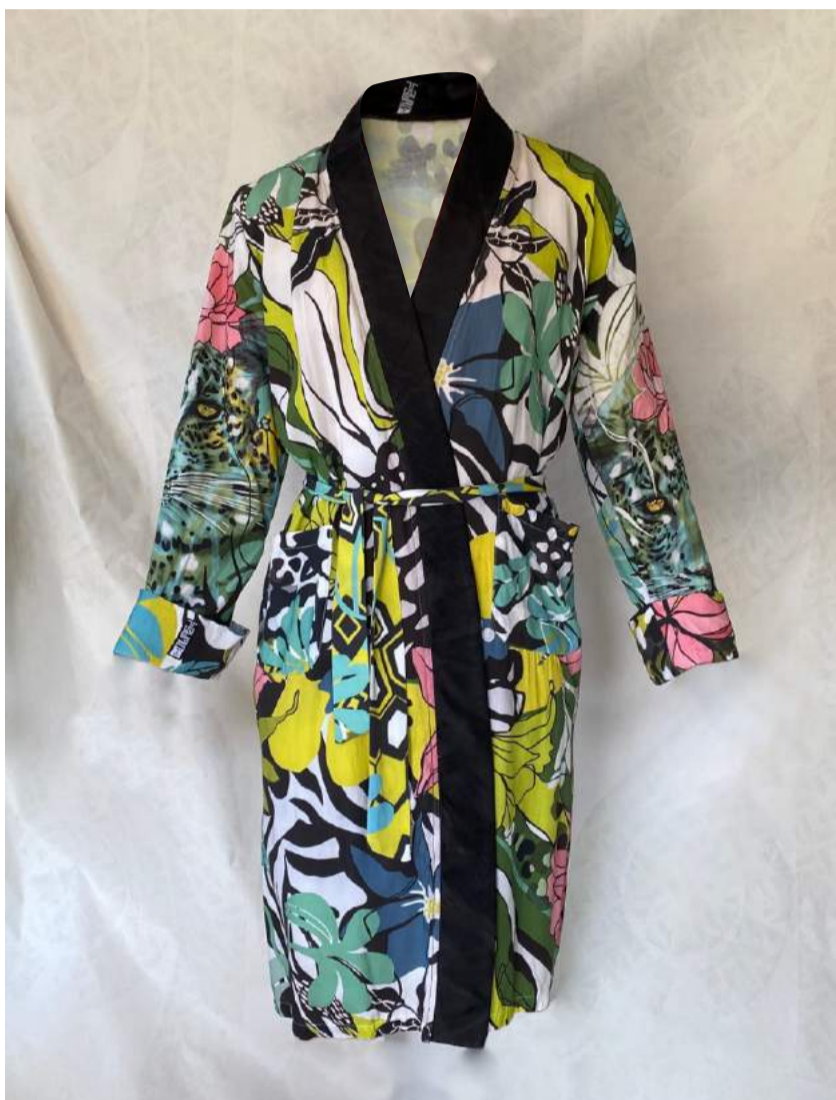
Kimono with belt.

Slight colour loss and softening can be expected over time.