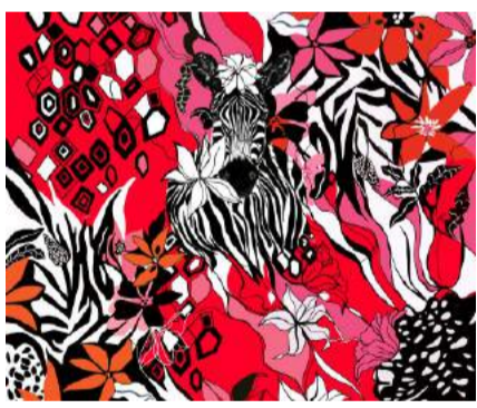
Zebra in the red