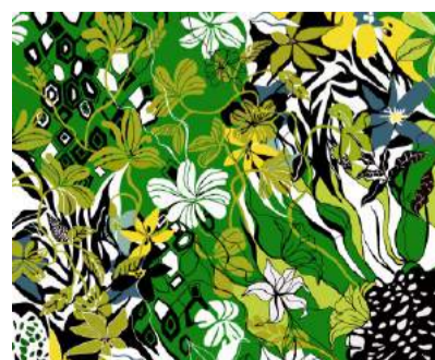
Zebra stripe print - light green