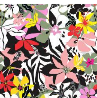
African Floral - in the pink