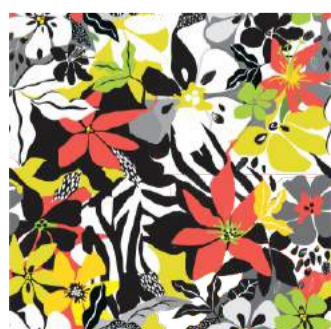
African Floral - Tangerine dreams

Great alternate pattern - African Florals