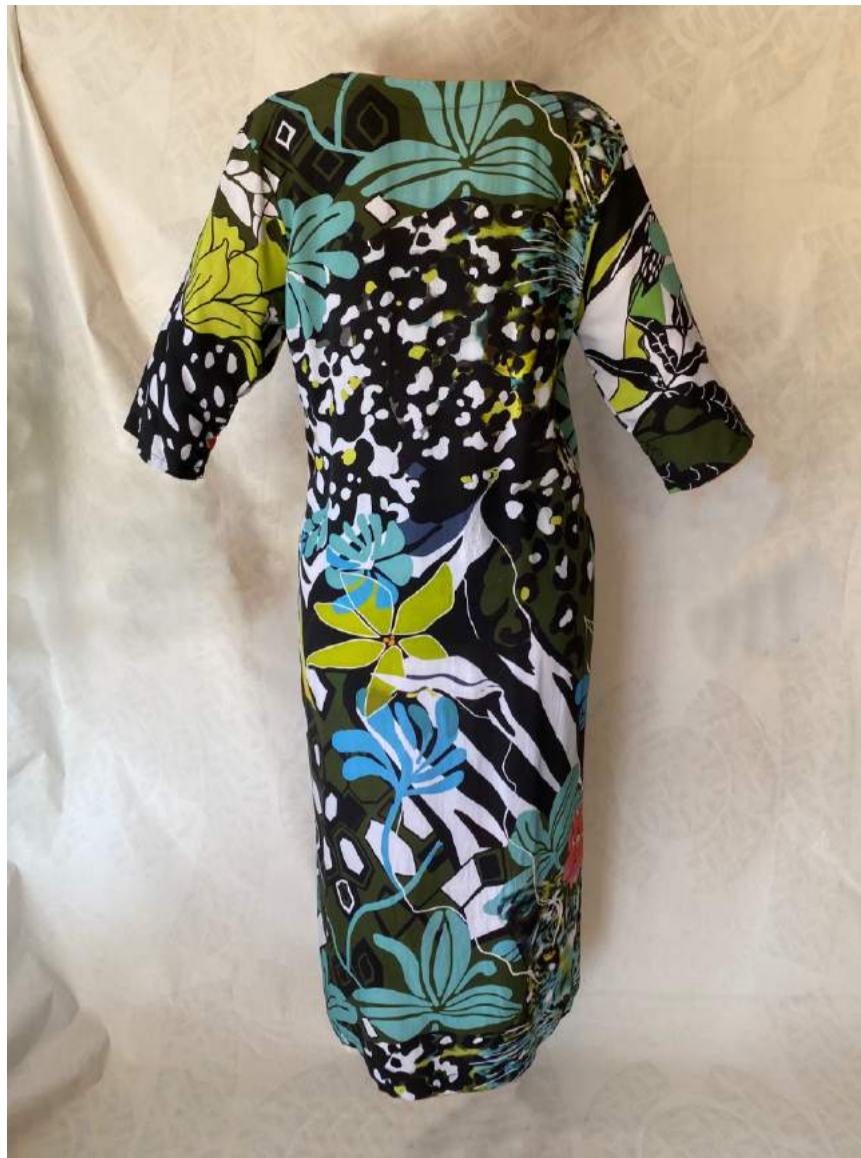
Shift Dress with Green leopard print - front and back. This style can be worn with or without a belt.