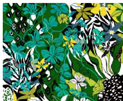
Zebra stripe print - dark green