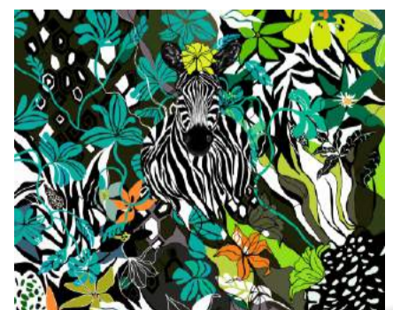
Zebra in the grey