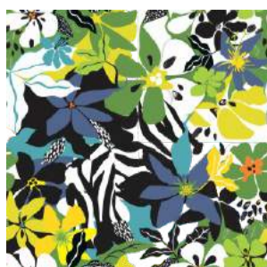
African Floral - in the blue