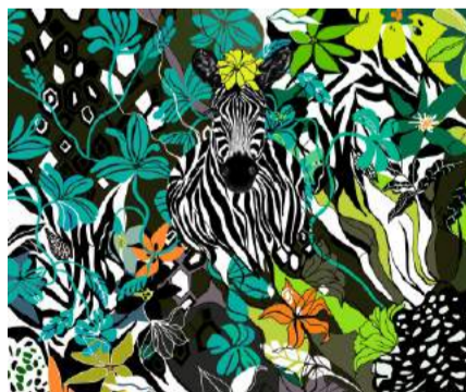
Zebra in the grey