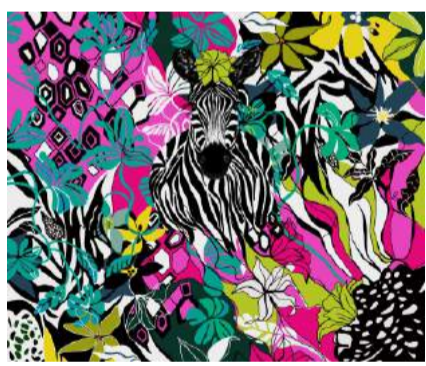
Zebra in the pink