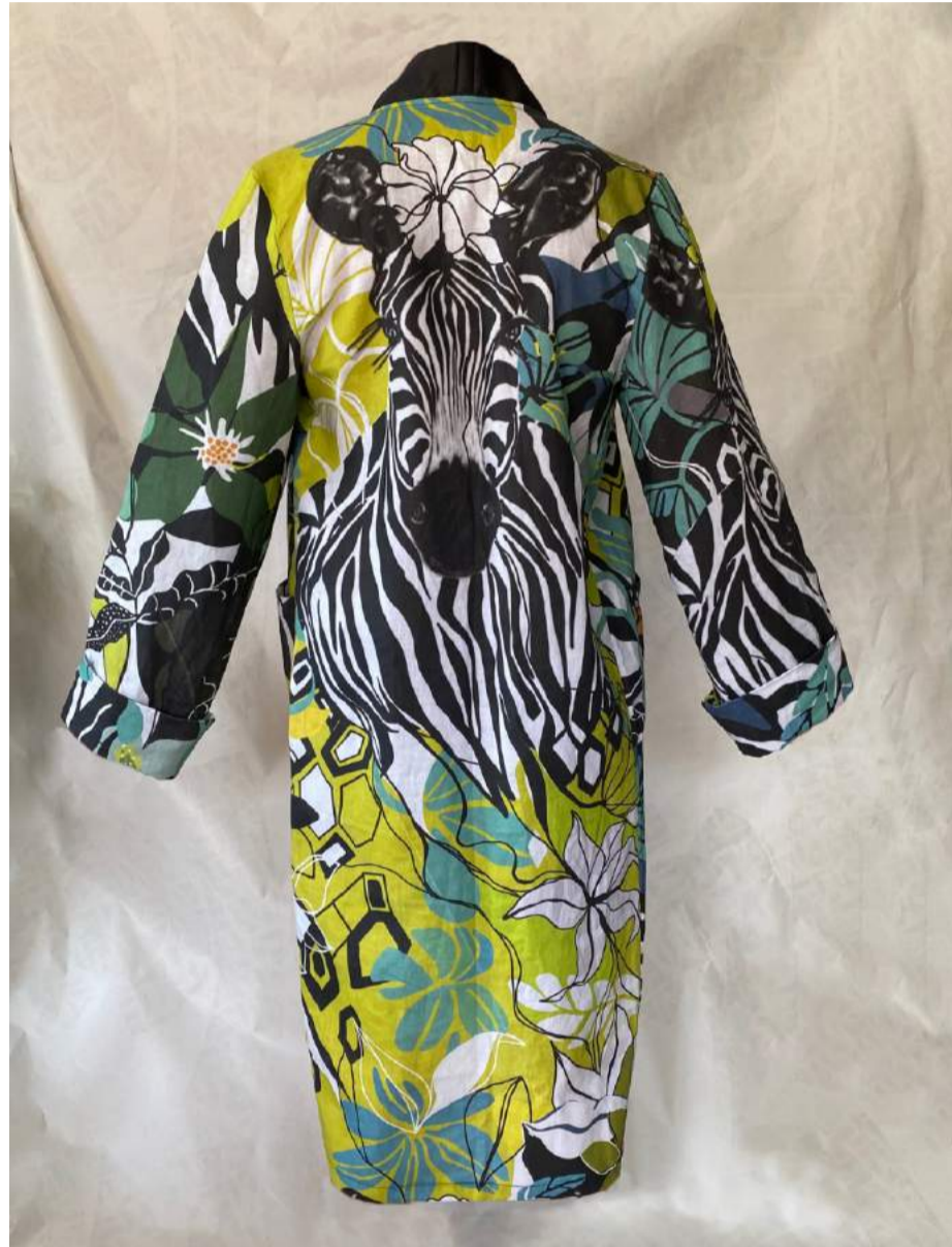
Light weight Duster coat does not wrap around the body. It has narrower front panels than those on the Kimono It does not come with a belt. All fabrics are available for this style