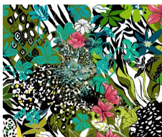
Leopard in the green

Great alternate pattern - African Florals