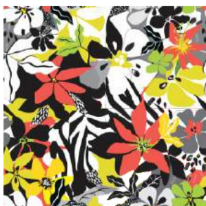
African Floral - Tangerine dreams

Great alternate pattern - African Florals