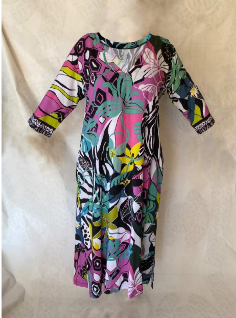
Shift Dress no belt