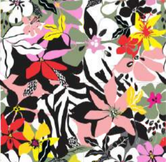
African Floral - in the pink