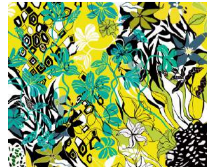
Zebra stripe print - yellow