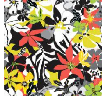
African Floral - Tangerine dreams