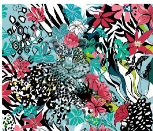
Leopard sky blue.