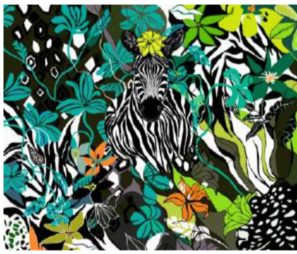
Zebra in the grey