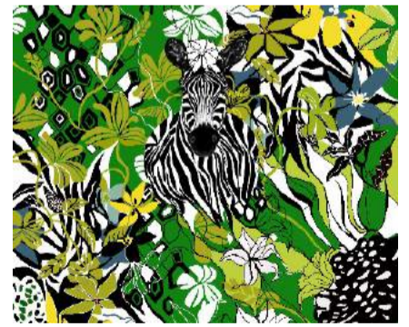
Zebra in the green