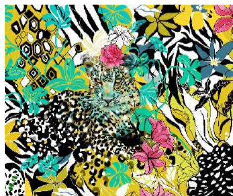
Leopard in the yellow