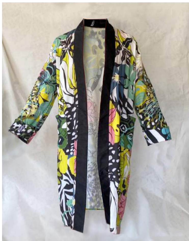
Kimono front & back. This style can be worn with or without a belt. Front panels are wide enough to wrap around the body

Cold wash garments inside out Slight colour loss and softening can be expected over time.