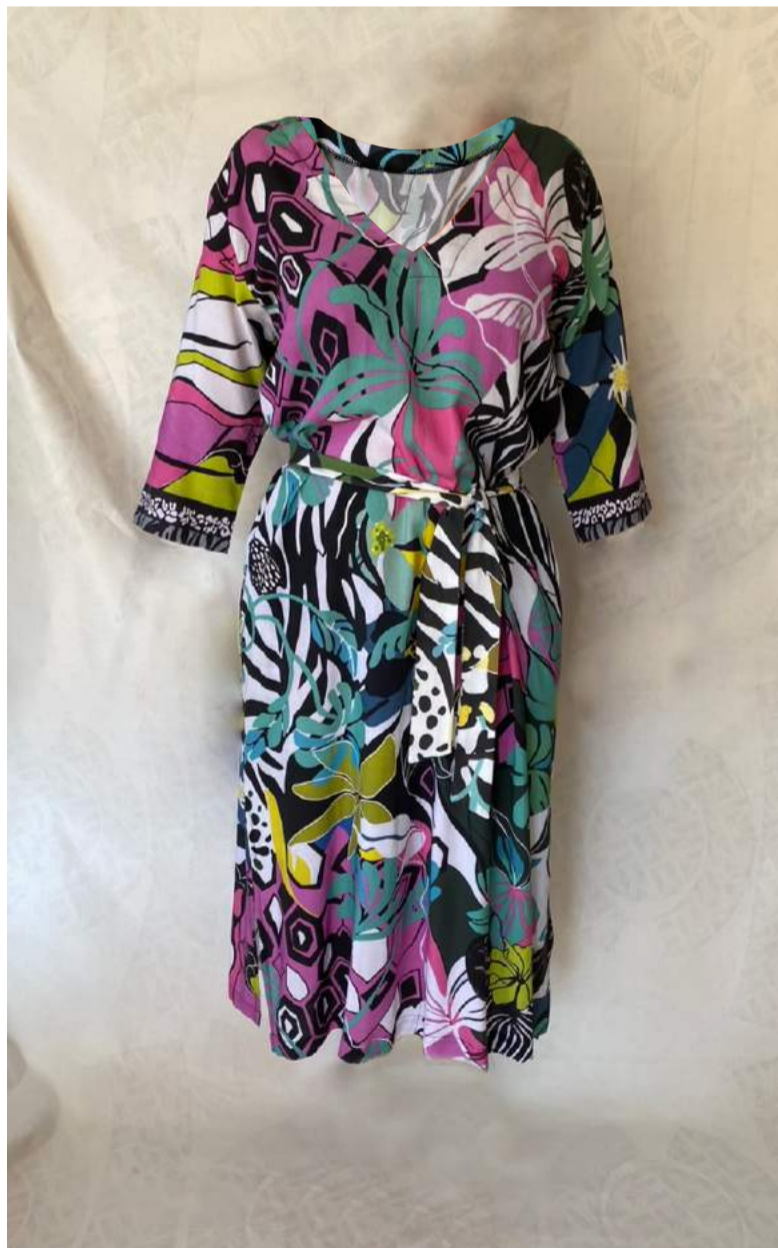
Shift Dress with belt