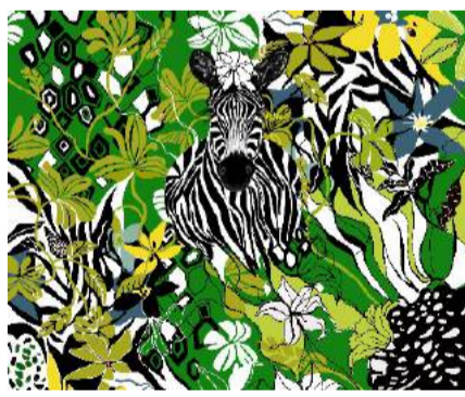
Zebra in the green