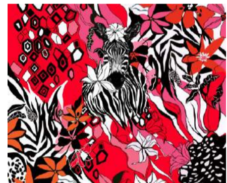
Zebra in the red