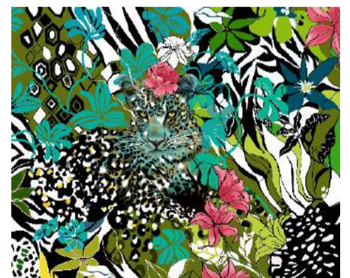
Leopard in the green

Great alternate pattern - African Florals