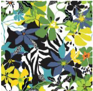
African Floral - in the blue