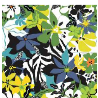
African Floral - in the blue