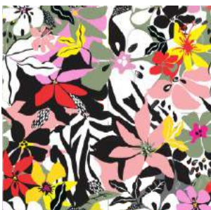
African Floral - in the pink