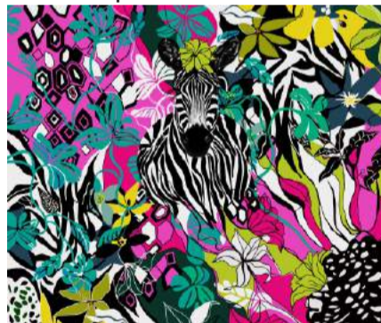
Zebra in the pink