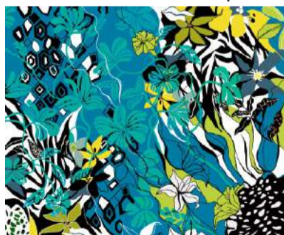
Zebra stripe print - blue

Also available in Floral African prints with no wildlife: