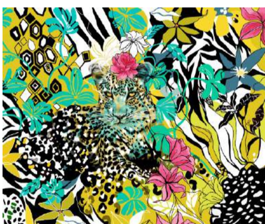
Leopard in the yellow